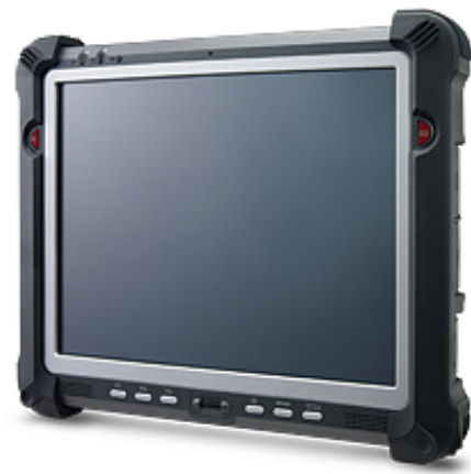
Operates on any Windows XP, 7 or 8 mobile computer

Tested, proven and continually improved for more than 17 years to support the essential business functions your airport demands, ASM merges your requirement for increased efficiency and enhanced accuracy with a software package specifically designed for airport operations. Woolpert provides 24/7 software support and customized training to help you reap the rewards of this mature, industry-leading solution. To further enhance the functionality of ASM, our team of experienced airport asset management and GIS professionals is working to integrate it with computerized maintenance management systems (CMMS), FAA-compliant GIS data and safety management system (SMS) processes and procedures.