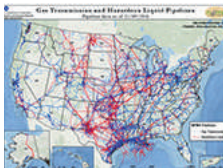
A map of major pipelines in the US. Recent legislation calls for greater information about the locations of buried pipes and utilities