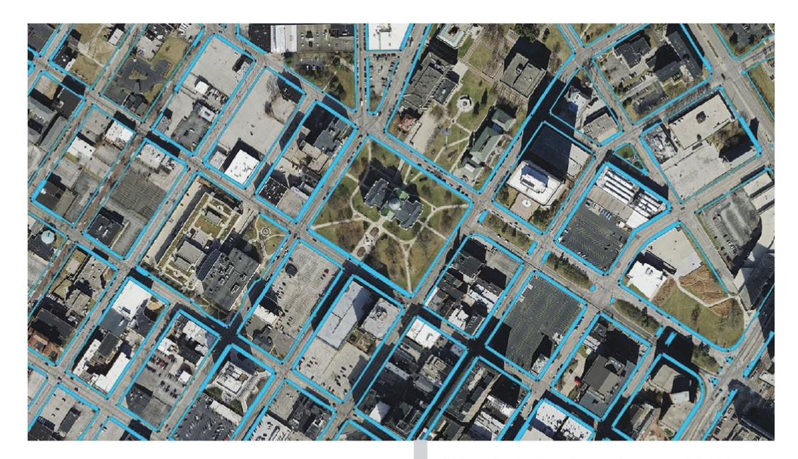
ners USGS and the Natural Resources Conservation Service.

The OSIP contract extends the opportunity to all local governments within Ohio to procure a higher imagery resolution and accuracy, which provides Ohio with a significant return on investment. Consider that since the first collection in 2006, the state has contributed approximately 15 percent of the total costs for all the products that have been delivered.